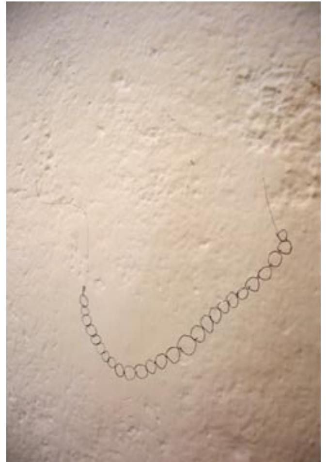
DRAWING PENCIL DIRECTLY ON THE WALL