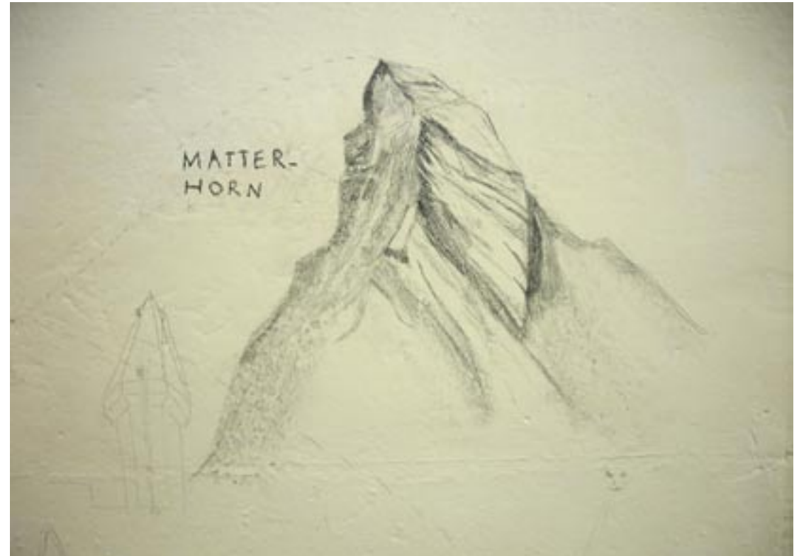
DRAWING PENCIL DIRECTLY ON THE WALL