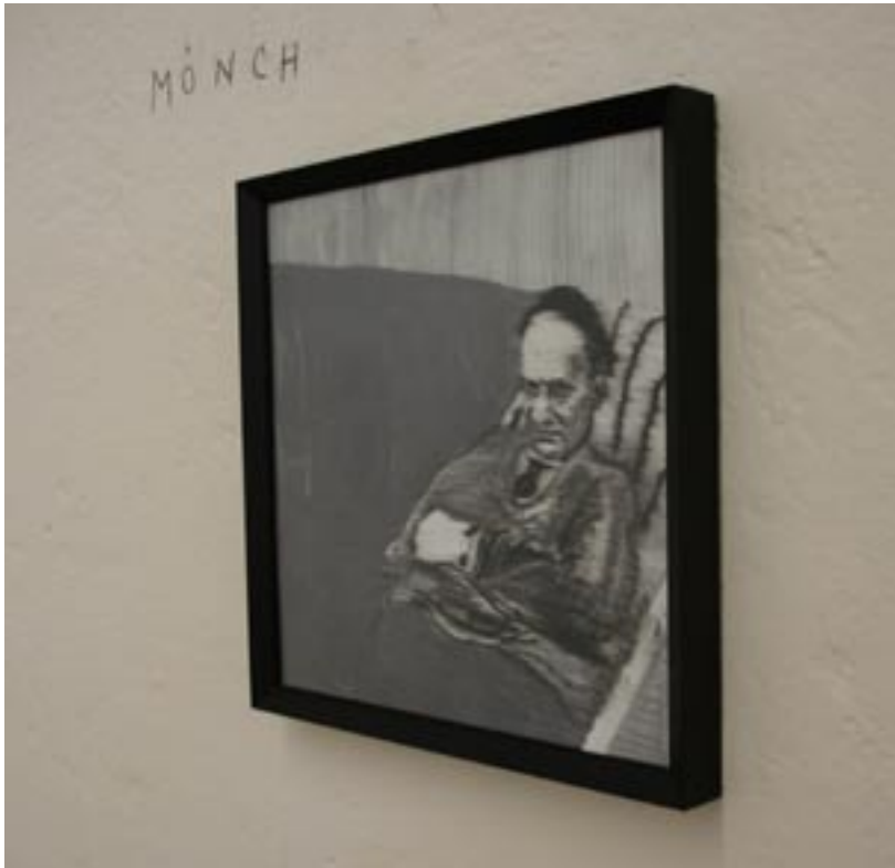
FRAMED DRAWING, PENCIL AND BLACK PEN ON PAPER, 30CM X 30CM, 2006