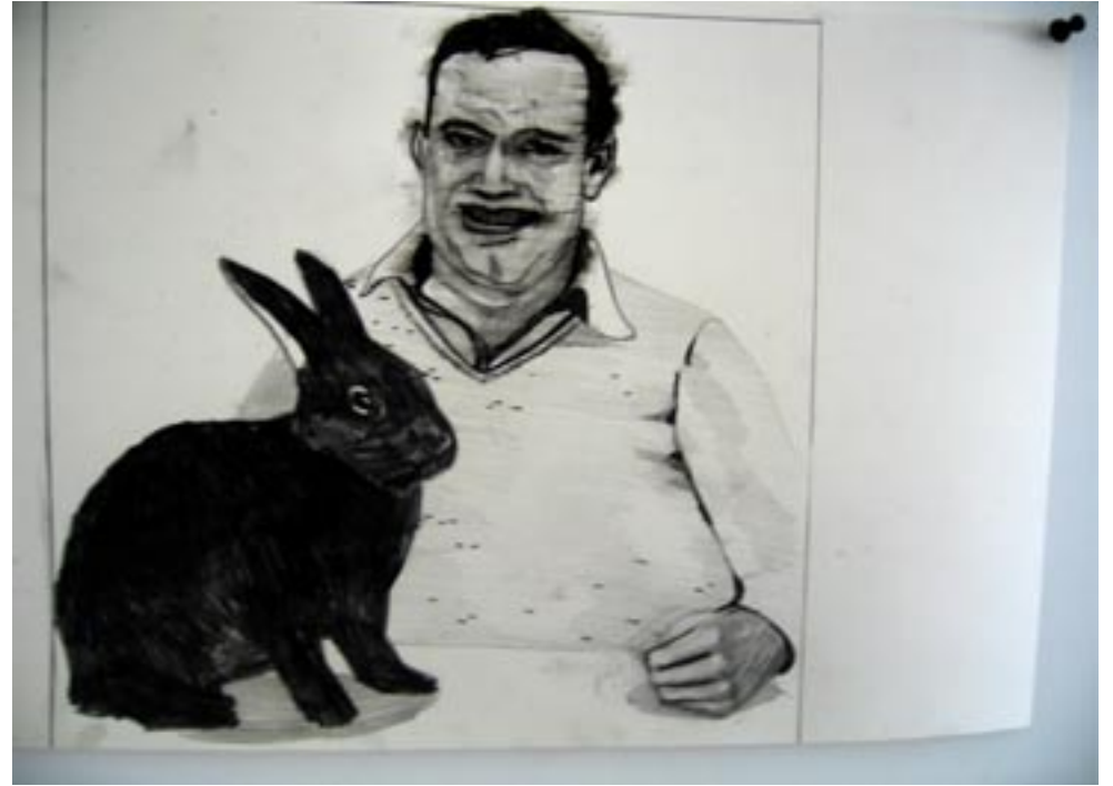
DRAWING PINED ON THE WALL, PENCIL AND BLACK PEN ON PAPER, 33CM X 45CM, (EACH)