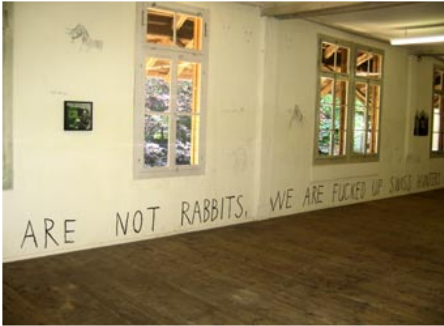
INSTALLATION VIEW, LEFT WALL