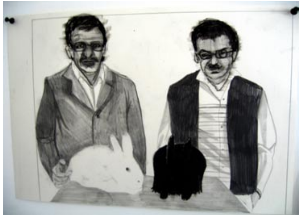
DRAWING PINED ON THE WALL, PENCIL AND BLACK PEN ON PAPER, 33CM X 45CM, (EACH)