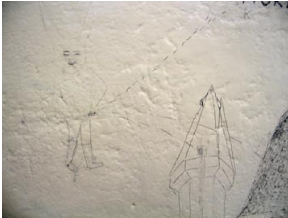
DRAWING PENCIL DIRECTLY ON THE WALL