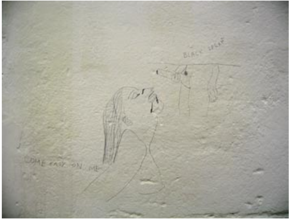
DRAWING PENCIL DIRECTLY ON THE WALL