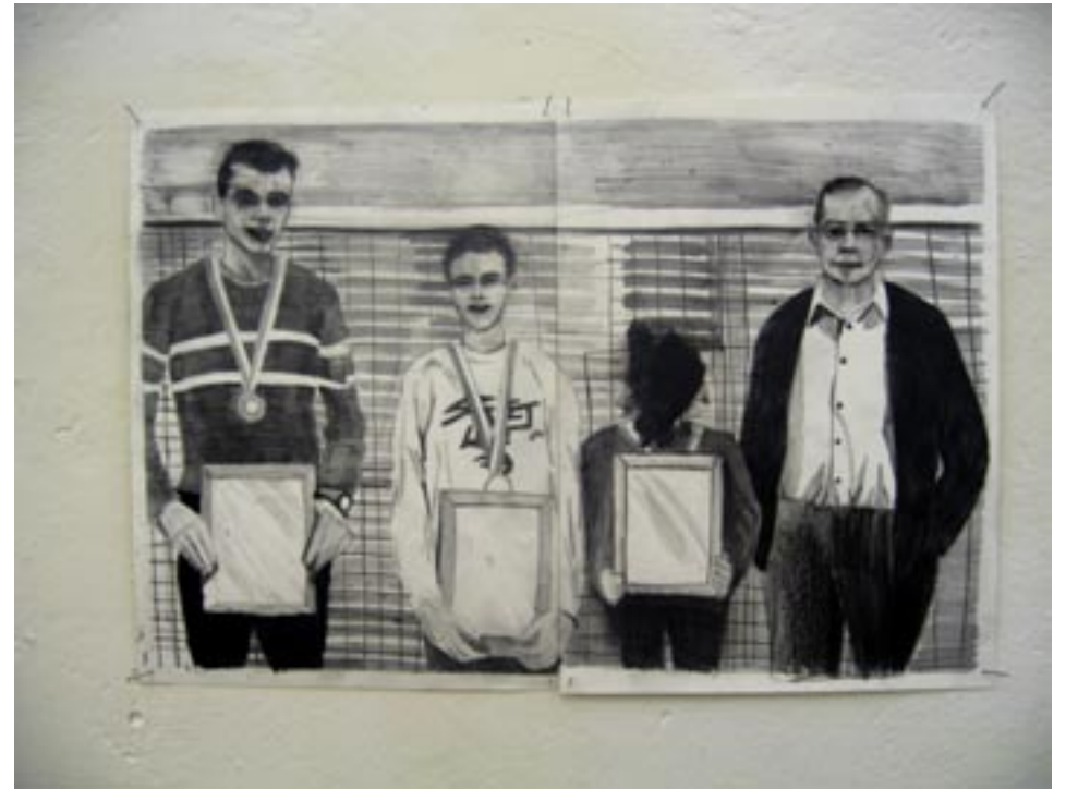
DRAWING PENCIL AND BLACK PEN ON PAPER, 60CM X 80CM, 2006