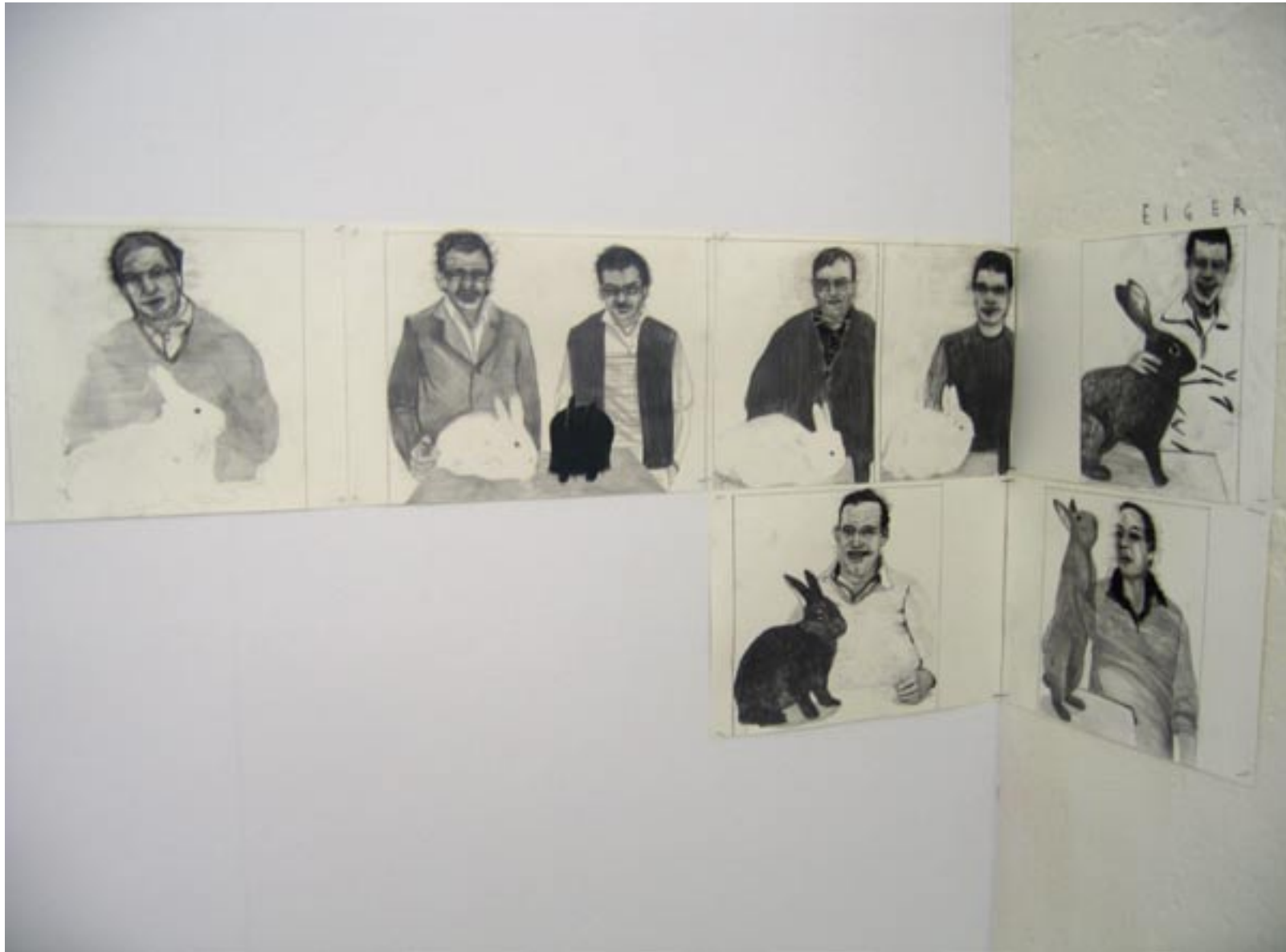
6 DRAWINGS PINED ON THE WALL, PENCIL AND BLACK PEN ON PAPER, 33CM X 45CM, 2006 (EACH)